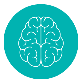
System Design & Installation Deployment