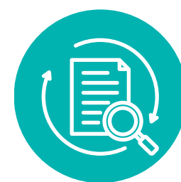
Audit & Compliance Support